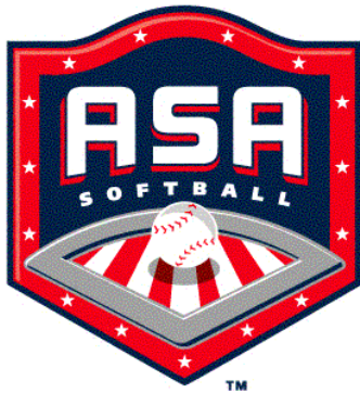
ASA registers over 250,000 softball teams which consists of over 3.5 million players.